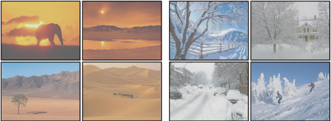
Figure 2. “Hot” and “cold” images presented in Study 6a. Each image was presented at 50% transparency (as seen here).

After they had answered the seven questions, participants were paid and debriefed.