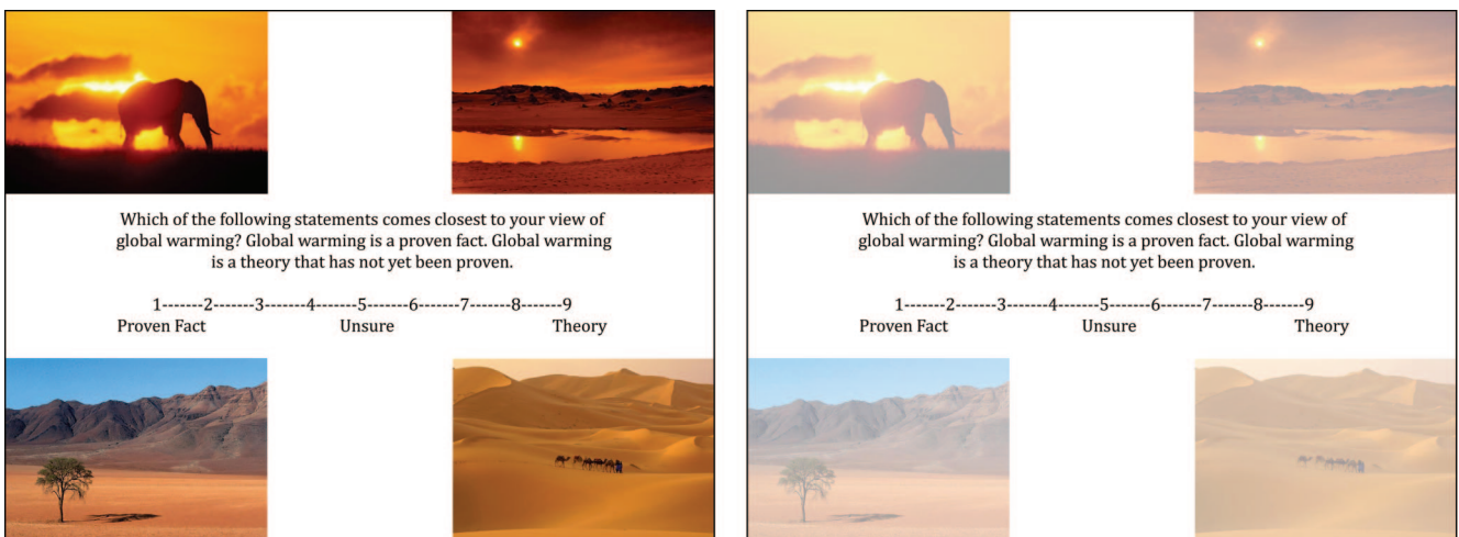
Figure 3. Fluent (left) and degraded (right) versions of the global warming question used in Study 6b. The fluent images were presented at 0% transparency. The degraded images were presented at 60% transparency. The black borders were added here to highlight the border of the computer screen. When the question stretched across the screen, it was easy to read.

Study 6a provided a direct test of simulational fluency, in which we examined the clarity of mental representations without changing anything about a stimulus to be processed. Study 6b used a manipulation more typical of processing fluency studies. This was done for three reasons. First, presenting an image as especially dull